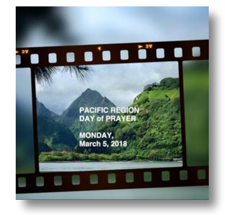
"How then shall they call on him in whom they have not believed? and how shall they believe in him in whom they have not heard? and how shall they hear without a preacher?" Romans 10:14

Every NATION across the Pacific Region... Every CHURCH ... Joining together in intercessory PRAYER!